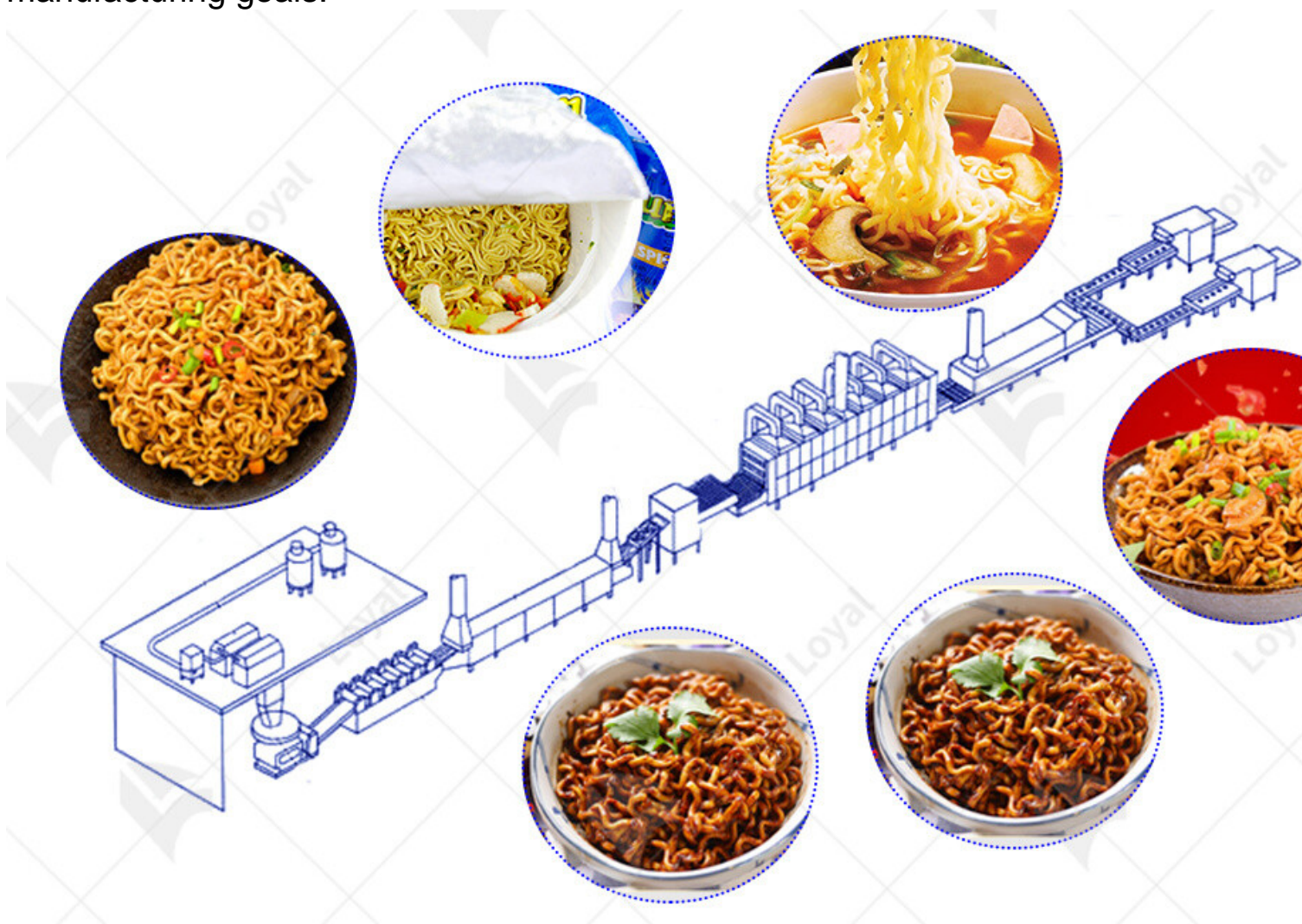
Instant noodle production line flow chart

Understanding these basic elements is the first step in choosing the right setup for your manufacturing goals.