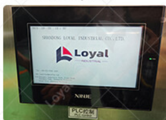
1. PLC control system