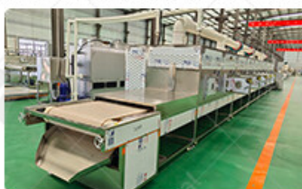
6. Machine Material : 304 stainless steel