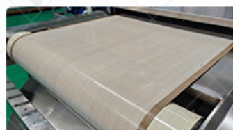
3. Belt: Customizable mesh belts of various materials