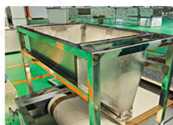
2. Material Feeder : Customizable according to your materials, both Liquid & Powder & Pellet available