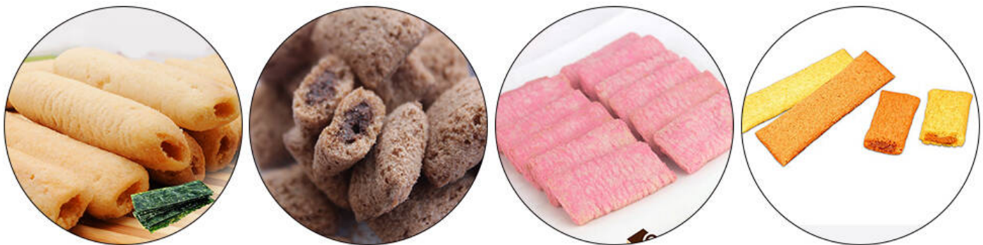
Core Filling Snack Machine Samples