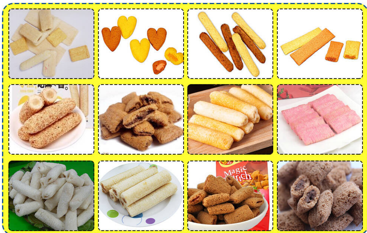
PHOTOS OF CORE FILLING CORN SNACK FOOD SAMPLES