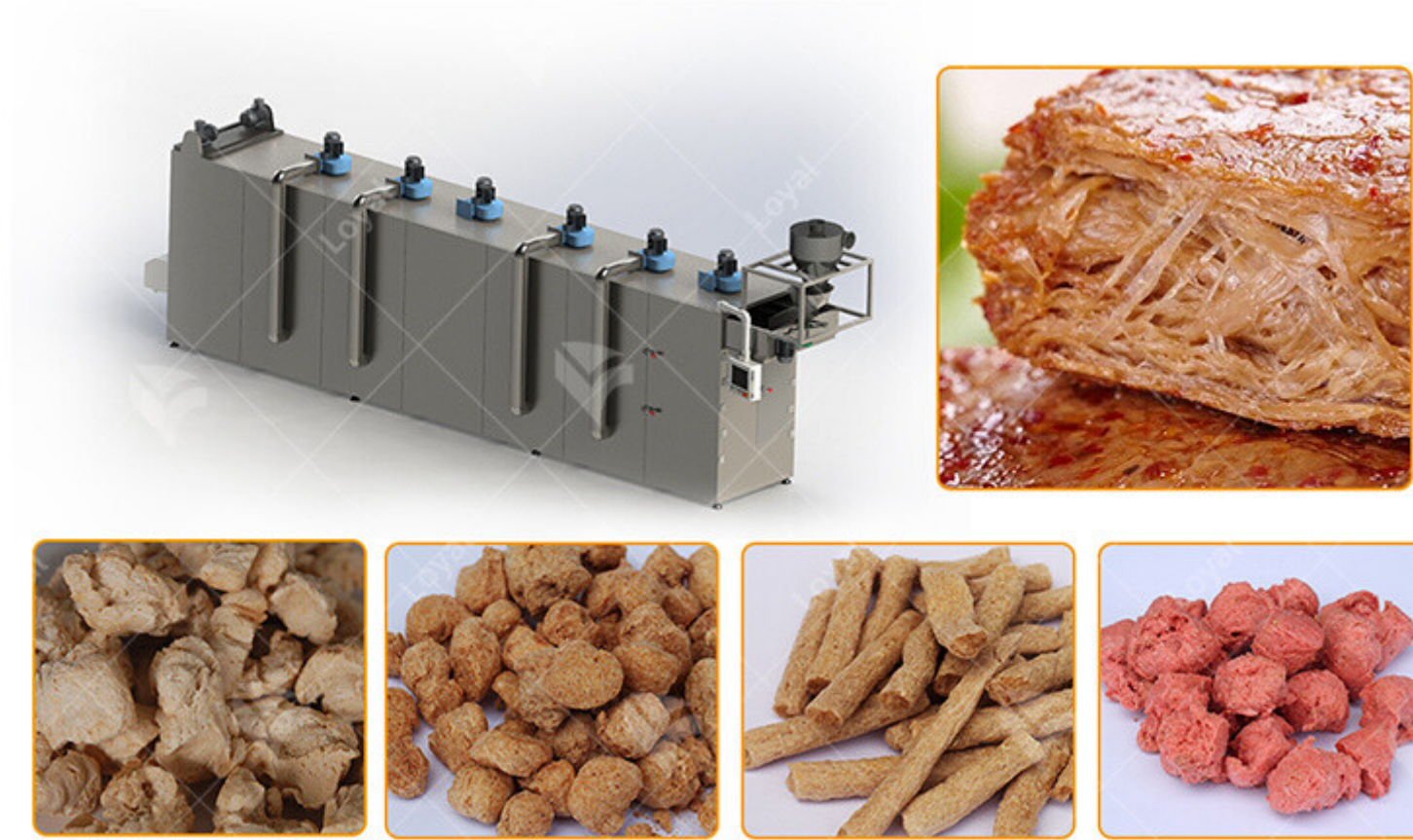
The Parameter Of Soya Meat Protein Process Line