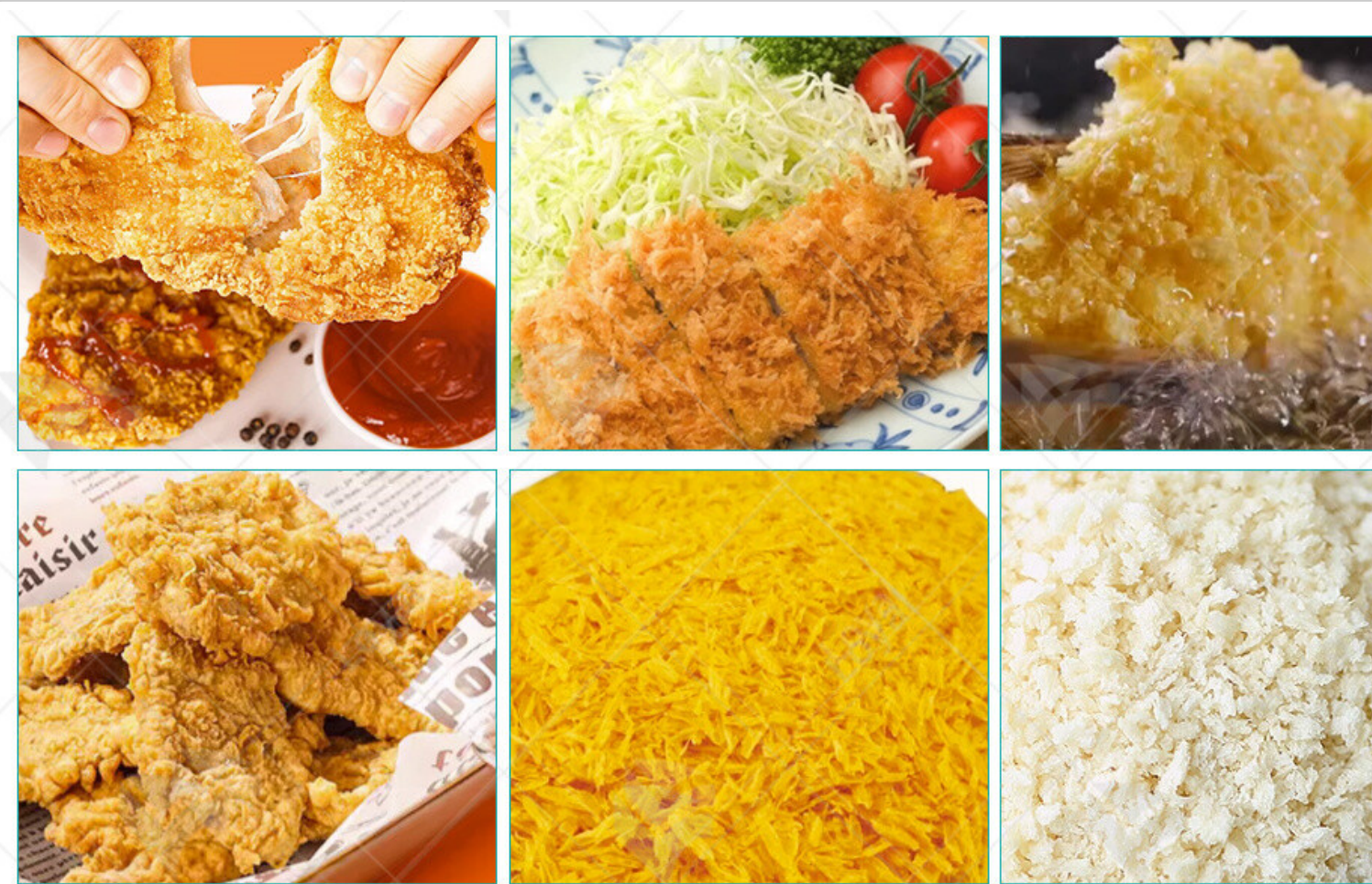
Key Features to Look for in a Panko Breadcrumb Machine