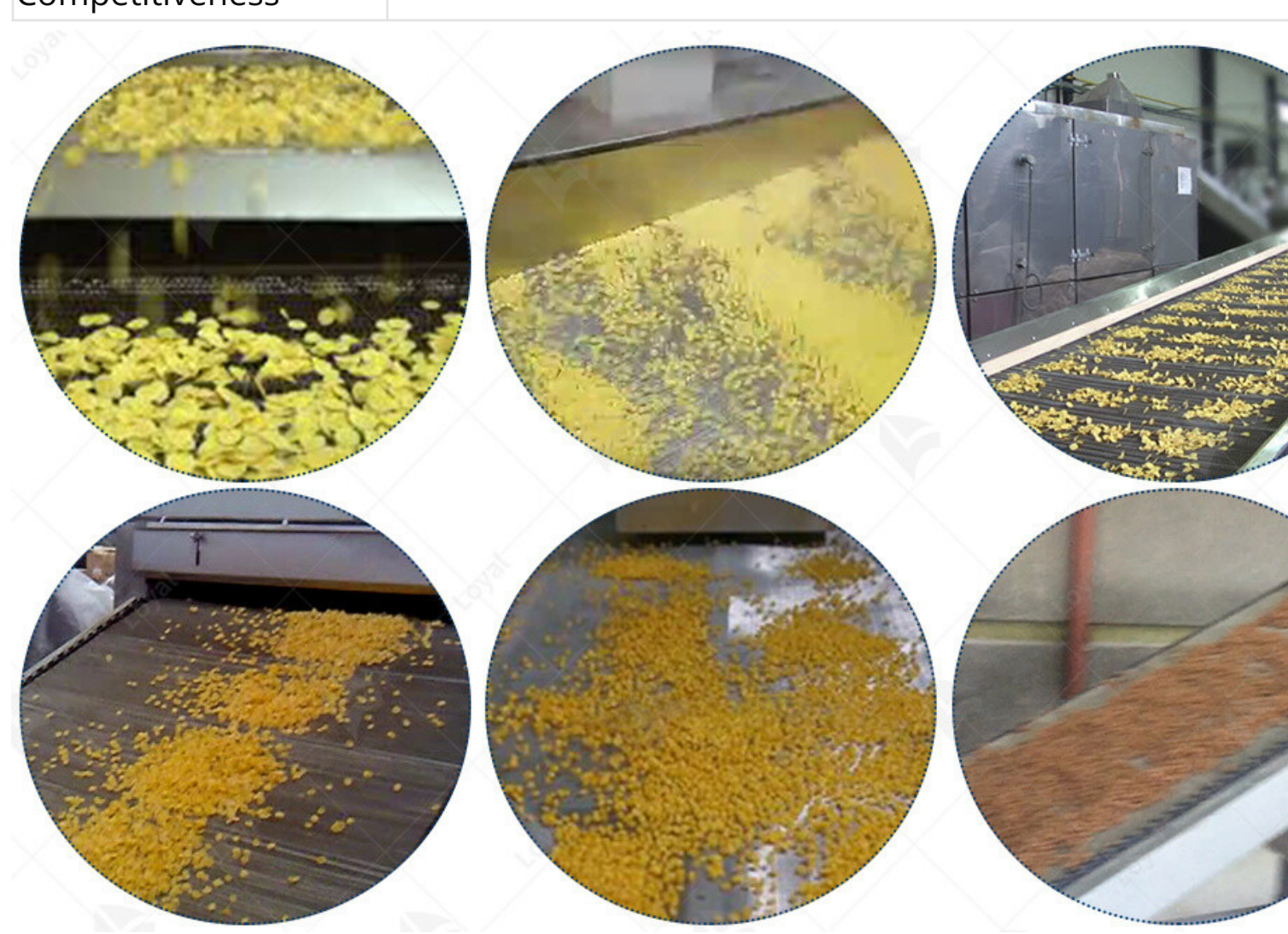
Advanced Corn Flakes Production Technology