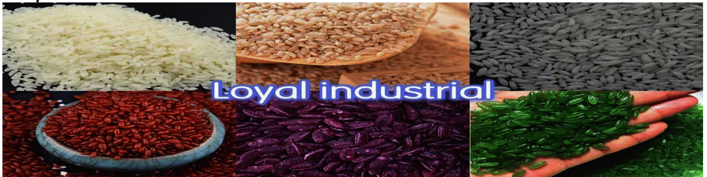
Sample Pictures of Industrial Instant Rice Making Machine Fortified Rice Processing Line