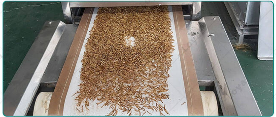
Test of Tenebrio Mealworm Insect Microwave Drying Sterilization Machine in Customer's Workshop Tenebrio Mealworm Insect Microwave Drying Sterilization Machine Video