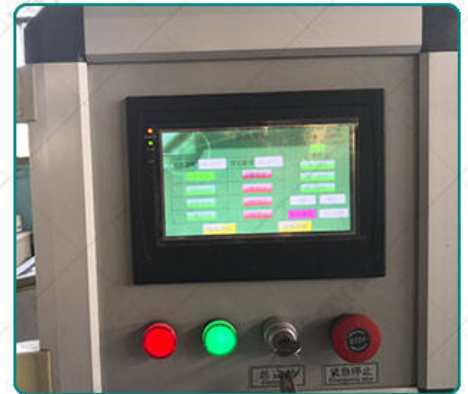
Detail of Tenebrio Mealworm Insect Microwave Drying Sterilization Machine