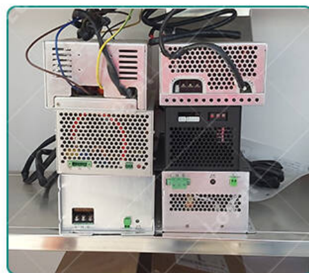
Detail of Layout of Microwave Insect Earthworm Tunnel Dehydrator Drying Machine in Workshop