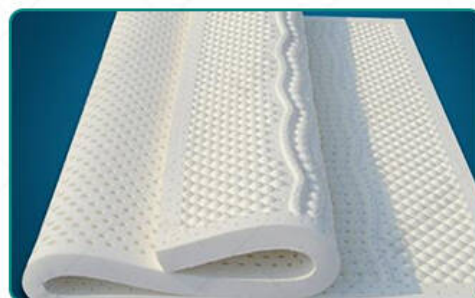
Sample of Continuous Microwave Rubber Mattress Drying Machine