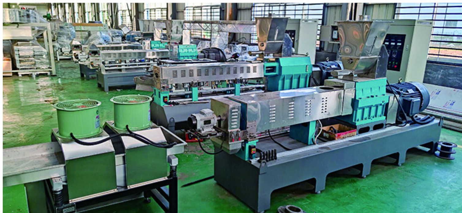
The Advantage Of Large Pet Feed Process Line