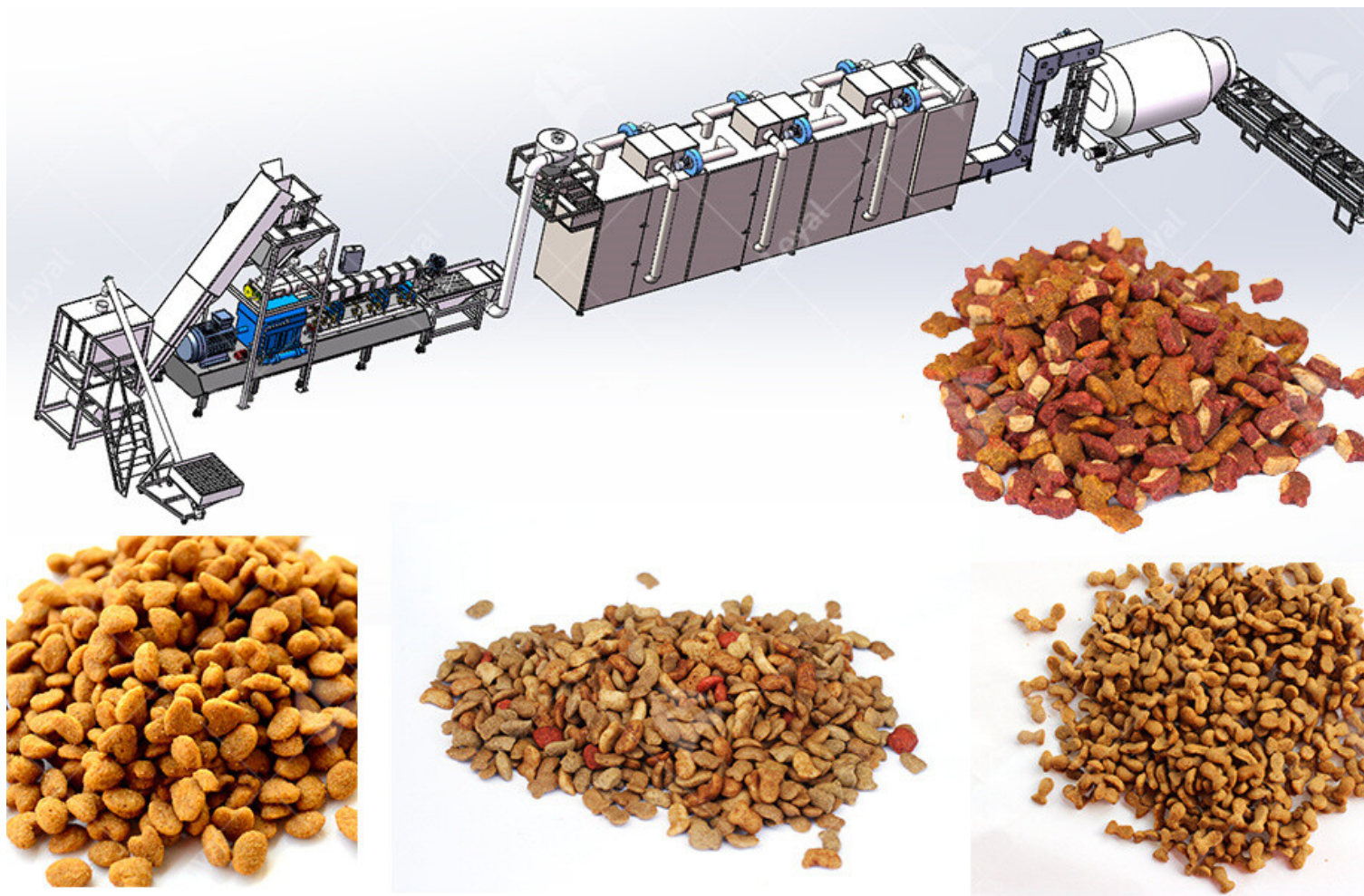
The Parameter Of Large Pet Feed Process Line