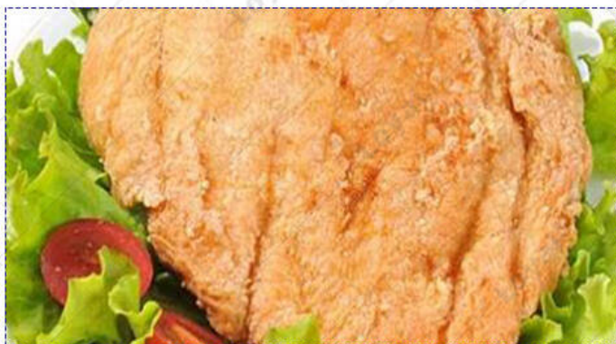
Samples Of Continuous Chicken Fillet Frying Equipment