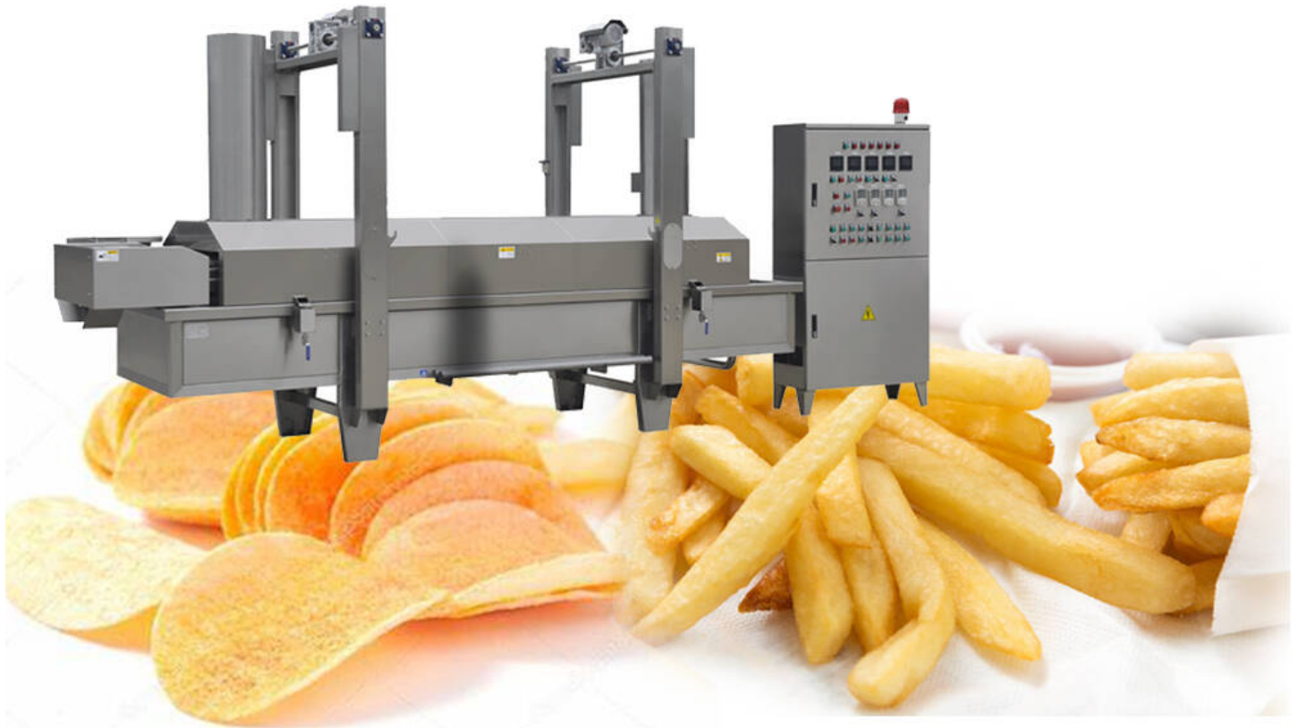
Industrial Fried Potato Chips French Fries Making Machine