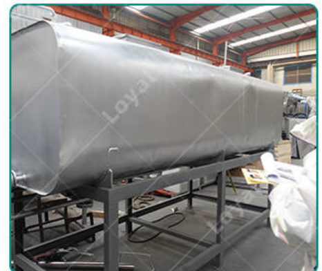
Feature Of Continuous Stainless Steel Potato Chips Fryer Manufacturing Equipment