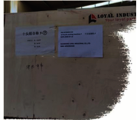
Packaging & Shipping