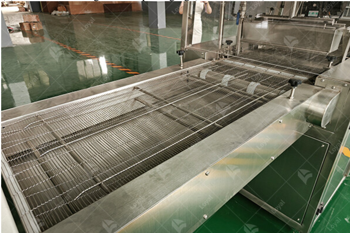
Features of nutrition bar production line

(3) Protection: Nitrogen-filled packaging (anti-oxidation) or aluminum foil lining (moisture-proof).