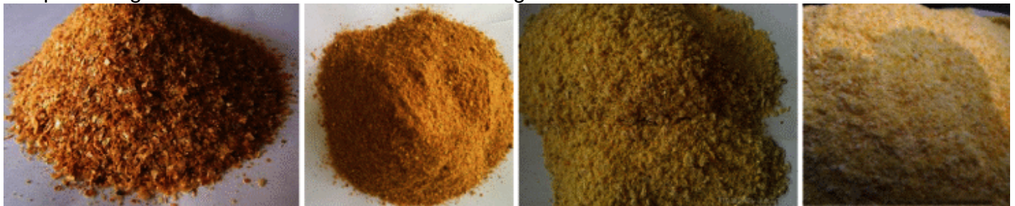
Snack Baked Kurkure Raw materials

Adopts corn grits as raw materials meanwhile mixing with water and oil.