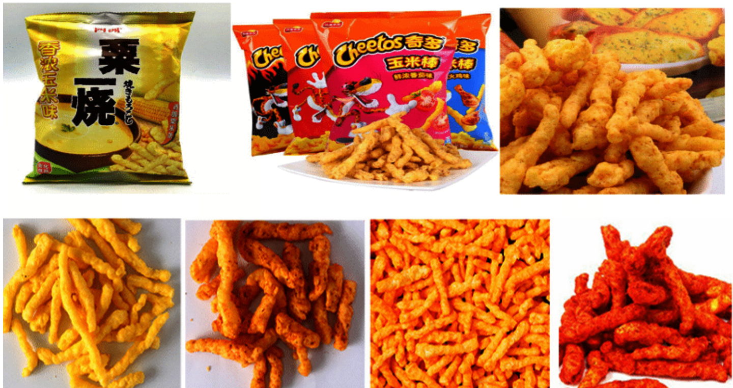
Kurkure Snacks Samples