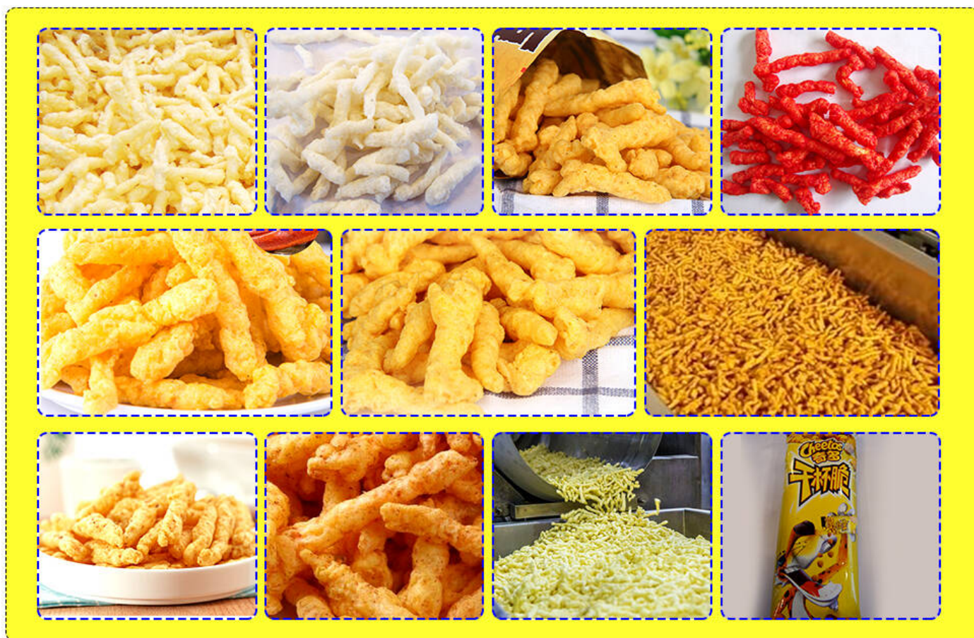
Kurkure Snacks Samples