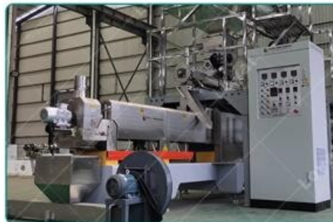
The Main Features and Functions of Pet Food Extrusion Equipment