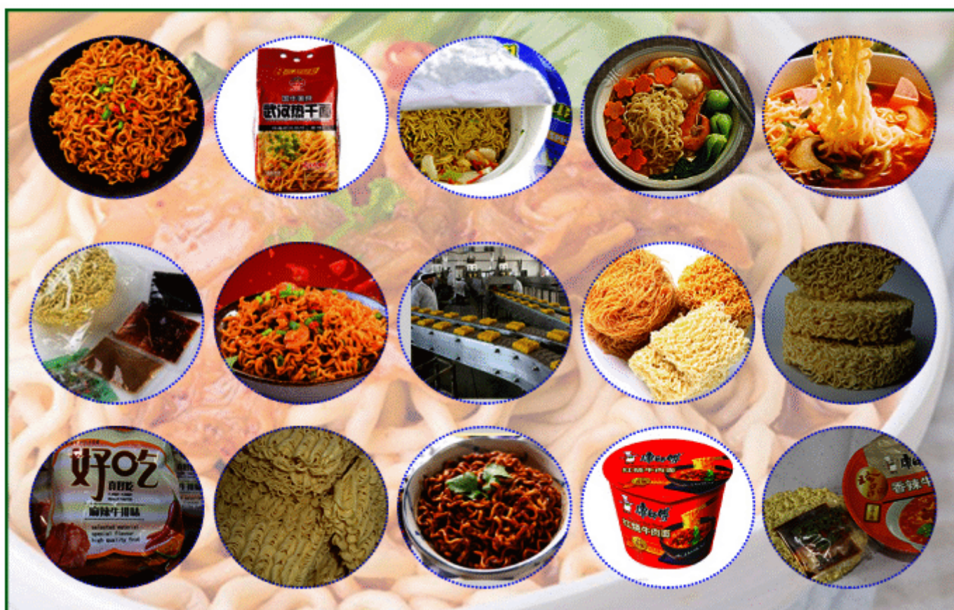
The sample of instant noodles line