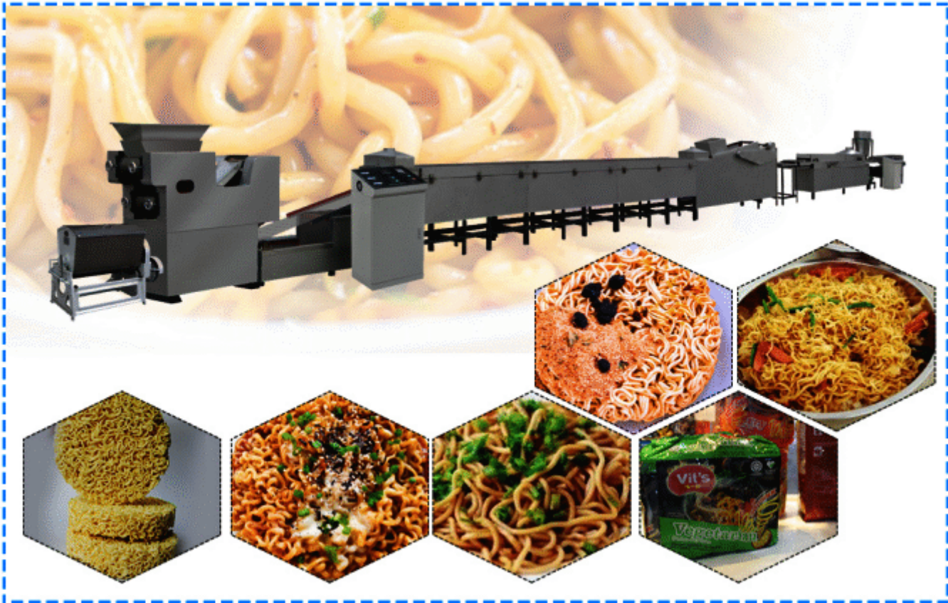
Instant noodles processing line