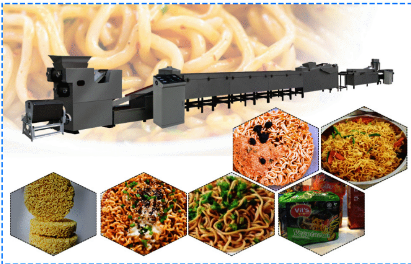
Instant noodles processing line