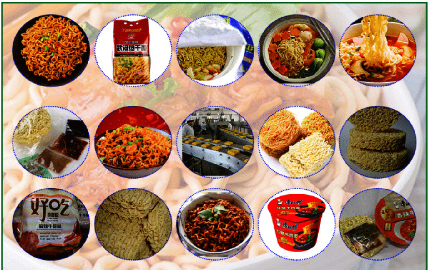
The sample of instant noodles line