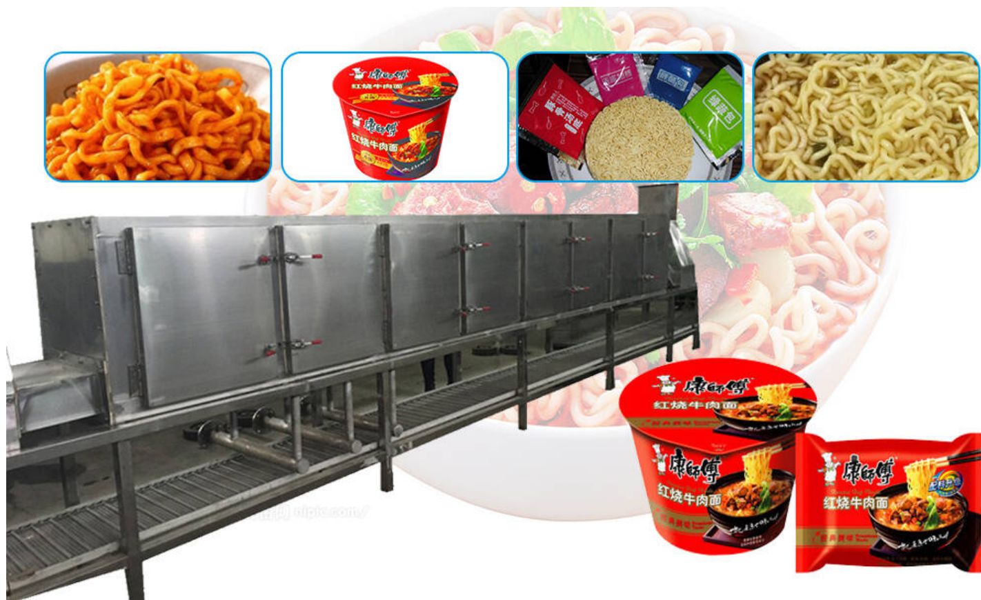
Instant Noodles Production Line