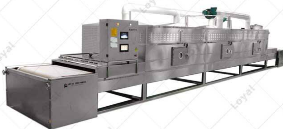
CAD Of Microwave Thawing and Sterilization Machine for Seafood