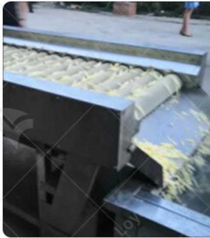
The Parameter Of Fully Automatic Potato Chips Process Line