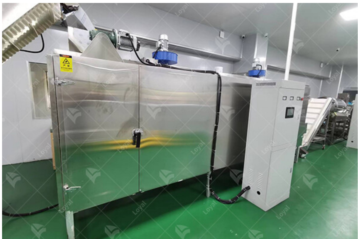
Technical specifications of core filling puffy snacksmaking machine