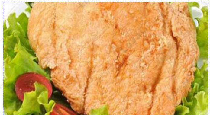
Samples Of Continuous Chicken Fillet Frying Equipment