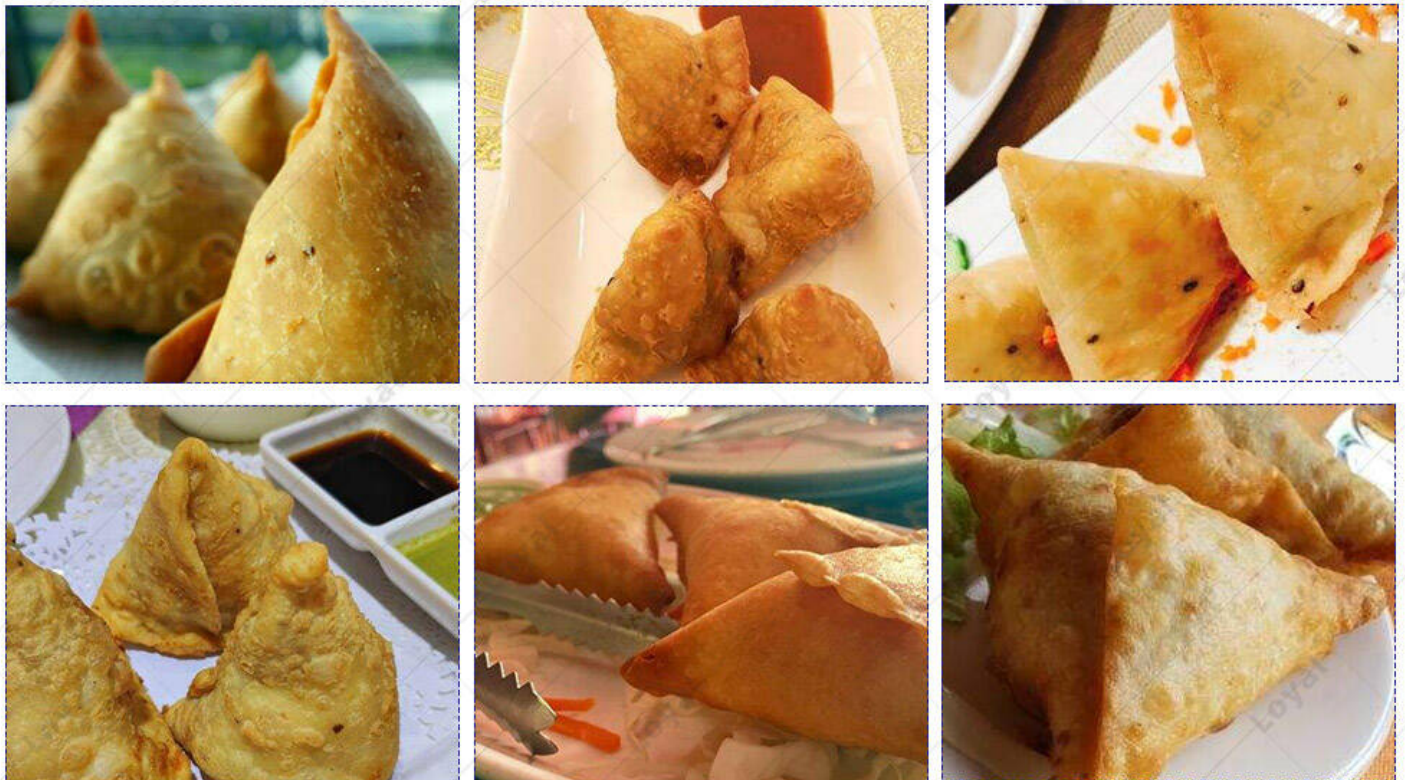
Continuous Fryer Samosa Processing Sample