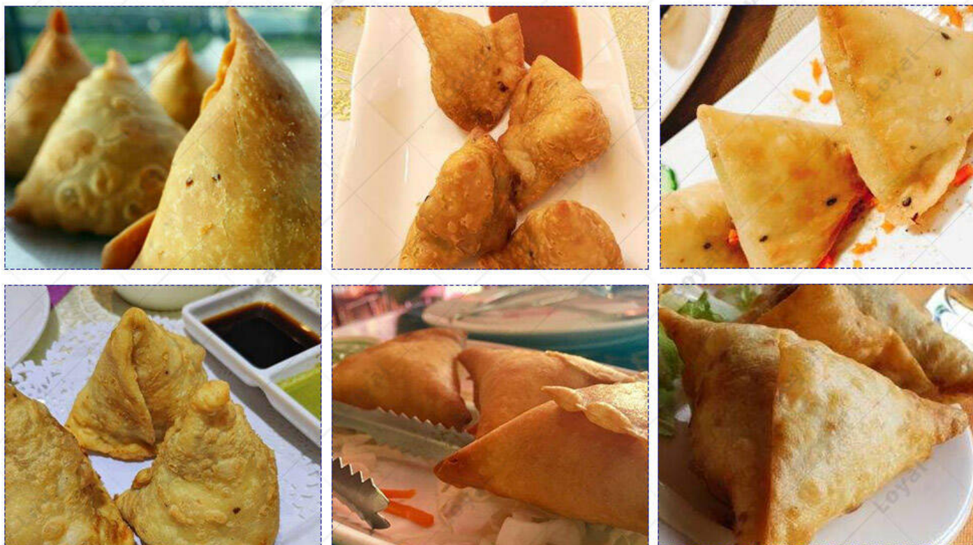
Continuous Fryer Samosa Processing Sample