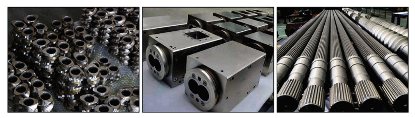
Fried Bugle Salad Chips Extruder Machine Detail Show