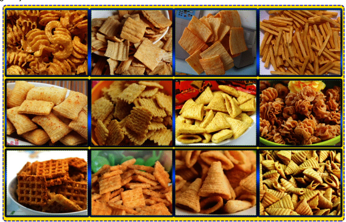
Fried Dough Food Chips Samples Made By Fried Bugle Salad Chips Machine

The raw materials can be rice powder, corn powder, wheat flour individually or their mixture. Only by changing the moulds, shaping or cutting machine, the shapes can be various, like sticks, square sheet rib chips, diamond chips, wavy chips, pillow shapes and bugles etc. The taste is savory and not greasy.