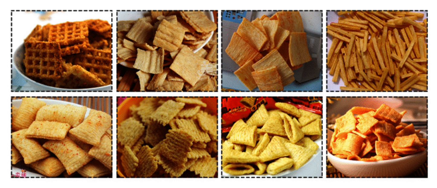
Fried Chips Making Machine Application

Fried Bugles Chips Production Line uses wheat flour as main material which are extruded, punched into triangle, fish shapes, and then fried and flavored. Such snacks with crispy taste, rich nutrition and digestible structure are very popular with many people all over the world. And most important, the waste punching chip can be reused after grinded into powder, which can greatly reduce the production cost.