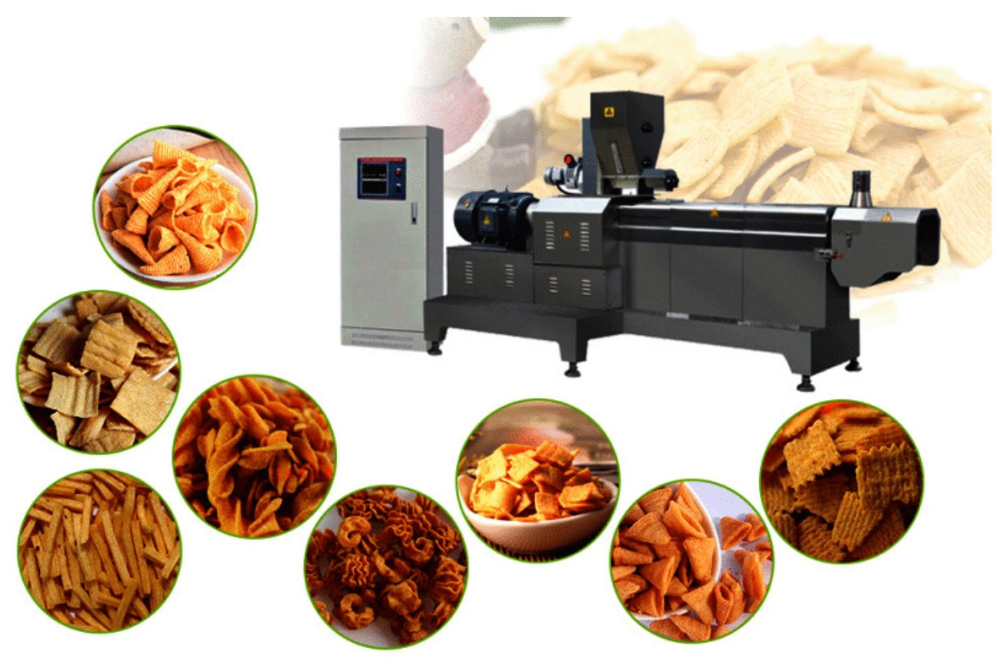
Fried Dough Food Salad Chips Making Machine