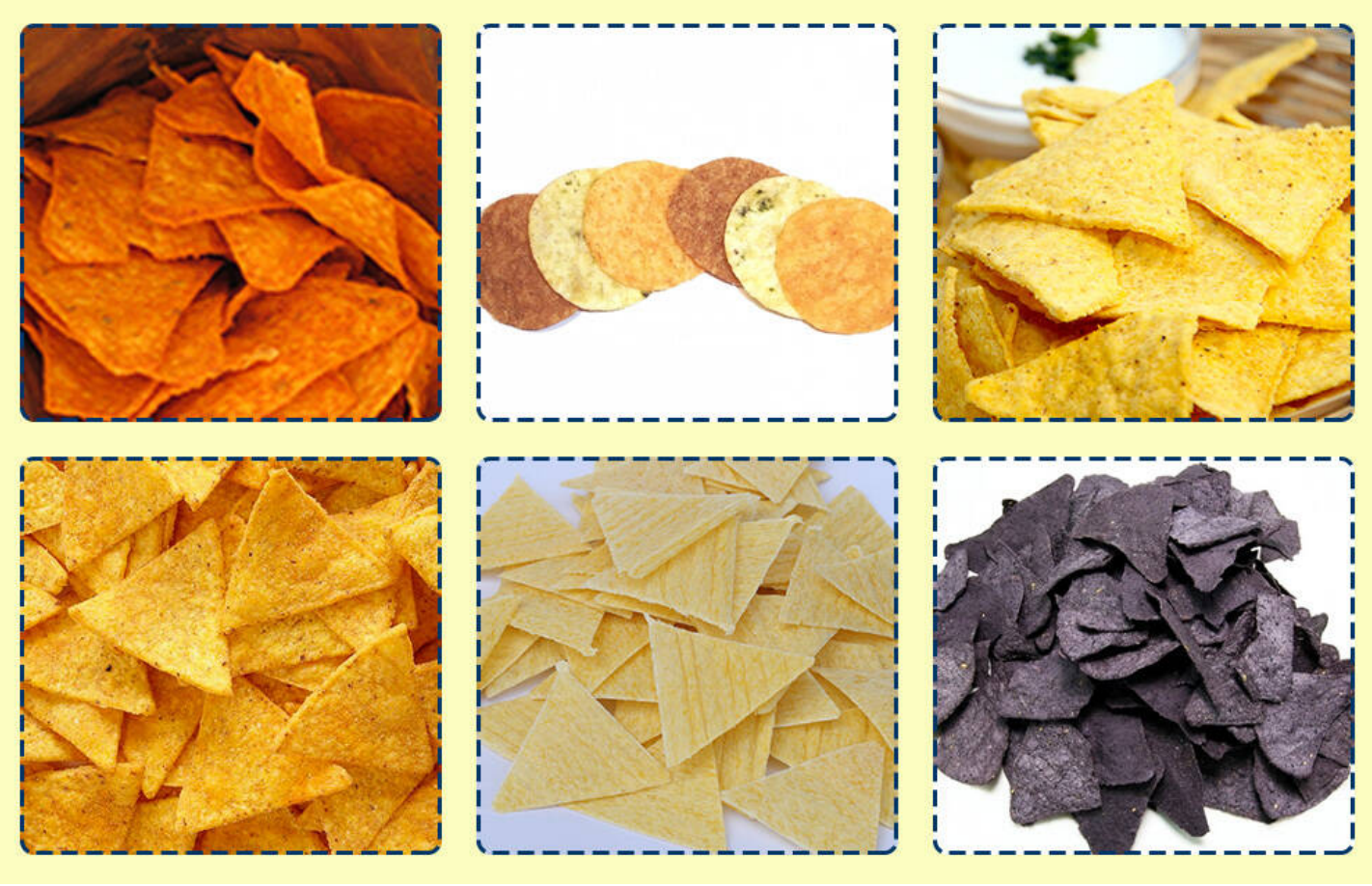
Corn Chips/ Fried Snakes/ Sun Chips Samples