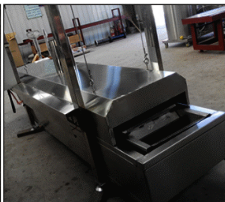
Fried Snacks Chips Frying Machine Processing Line