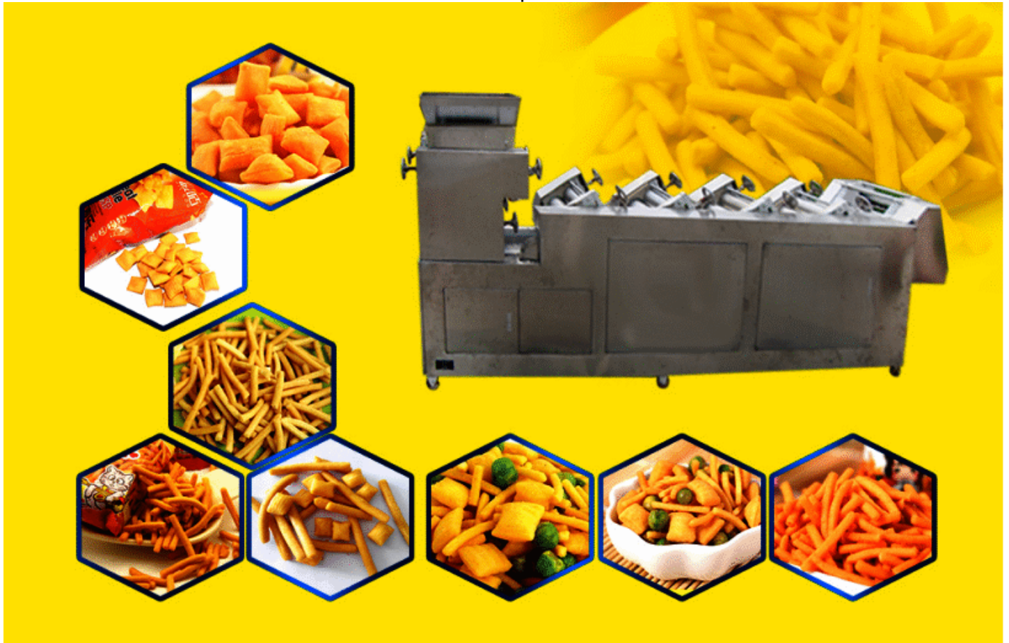
Fried Dough Snack Making Machine

Fried dough snack production line is for processing dough with wheat flour, and then shaping and cutting the skin into forming products. After being pressed by serious stainless rollers, they can be separately cut into pillow or stick shapes and expanded by frying. After that, they can be flavor-mixed and dried till they become appetizing and snack foodstuff. Fried wheat flour based snack process line is reasonably designed and conveniently operated, with the fermentation and drying function. The shapes of product are changed and they taste crispy and delicious after fried and flavored in the processing of the Fried dough snack production line. No need a dryer, simple process, less investment. It is the best choice for middle-sized companies.