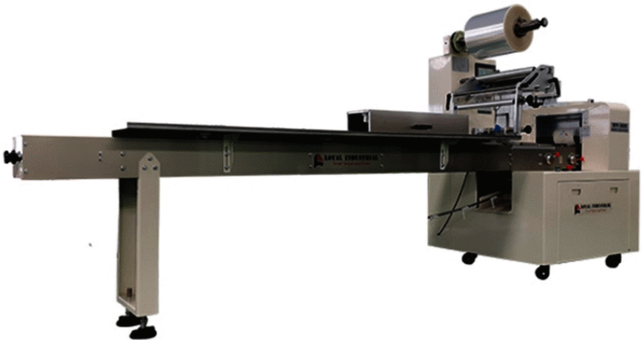
High Speed PLC Control Automatic Biscuit Packing Line For Biscuit Perfume Cigarette