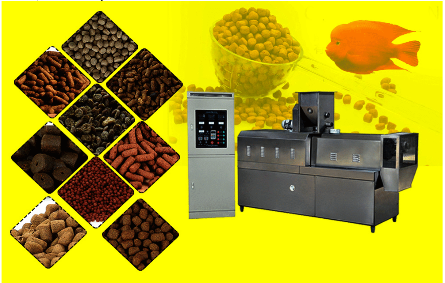
Fish Feed Extruder Making Machine

The automatic stainless steel fish feed production line is composed of feeding system, extrusion system, rotary cutting system, heating system, transmission system and control system. The fish feed machine Adopt advanced twin-screw extrusion technology, use high temperature and high pressure to mature and expand the material, and complete the whole process at one time. The host adopts frequency conversion speed regulation to ensure the stability of the production process. The fish feed have novel shapes, bright colors, various types, natural and lifelike, delicate taste, balanced nutrition, and are widely used in raw materials.