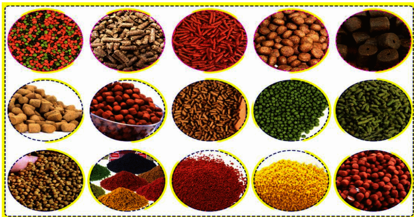
Products Sample of Floating/Sinking Pet Fish Feed