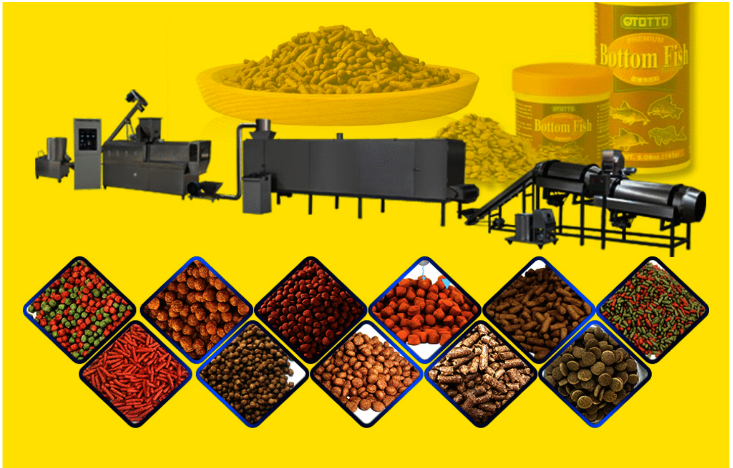
Full Automatic Floating/Sinking Fish Feed Processing Line