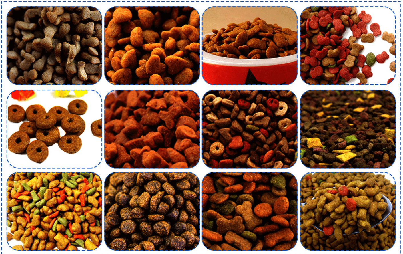
Pet Food Products Sample

The full automatic pet food processing line can be applied to cats, dogs, foxes, monkeys, pigs, sheep, rabbits, fish, shrimps, poultry, birds, etc. The pet food machine can adjust the process parameters of raw materials, temperature, moisture, etc. The size and shape of pet food can be adjusted by changing the mould and cutting speed. Different raw material and nutrient elements can be added together according to advanced formula, so the final products are tasty and easy to digest. It can adjust the pet feed machine according to customers' requirement.