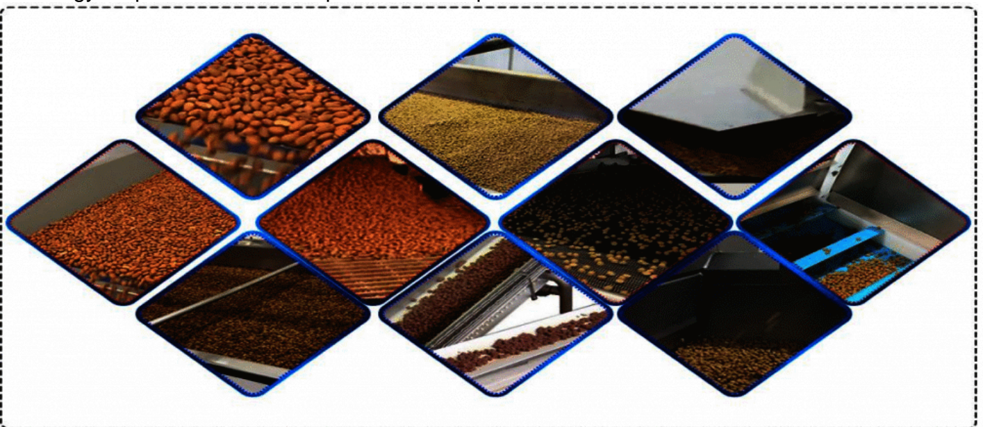
Pet/Dog/ Cat Food Sample

The automatic dog food production line uses grain meal, soybean meal, meat meal, fish meal, bone meal, rice bran, milk powder, etc. as raw materials. Double screw pet food extruder can use different ingredients into pet food formulations: wheat flour, corn flour, corn grits, soy meal, fresh meat, bone powder or fish flour. and also can also include additives such as animal and vegetable fat and minerals, amino acids and vitamins and flavor enhancers. The advanced extrusion concept the latest technology for production in the aquatic feed and pet food industries