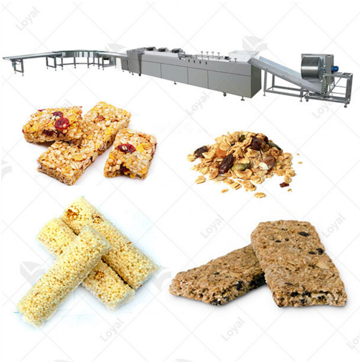
Nutrition bar production lineflow chart

Sugar boiled pot--- Mixer--- Cereals bar cutting machine--- Packaging machine