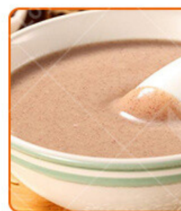
The Parameter Of Nutrition Powder Process Line