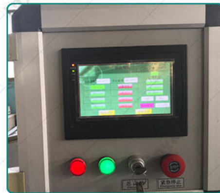
Detail of Tenebrio Mealworm Insect Microwave Drying Sterilization Machine