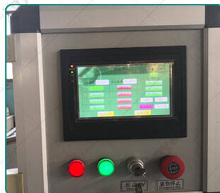
Detail of Tenebrio Mealworm Insect Microwave Drying Sterilization Machine