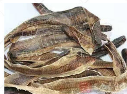
Layout of Microwave Insect Earthworm Tunnel Dehydrator Drying Machine