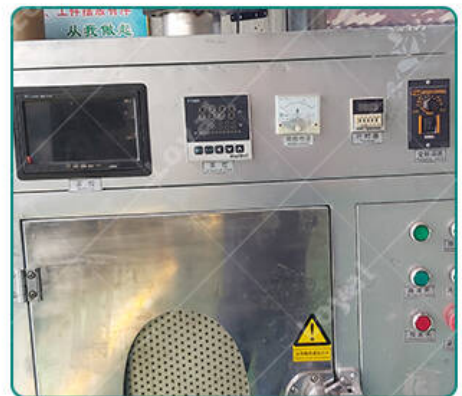
Continuous Microwave Rubber Mattress Drying Machine in factory