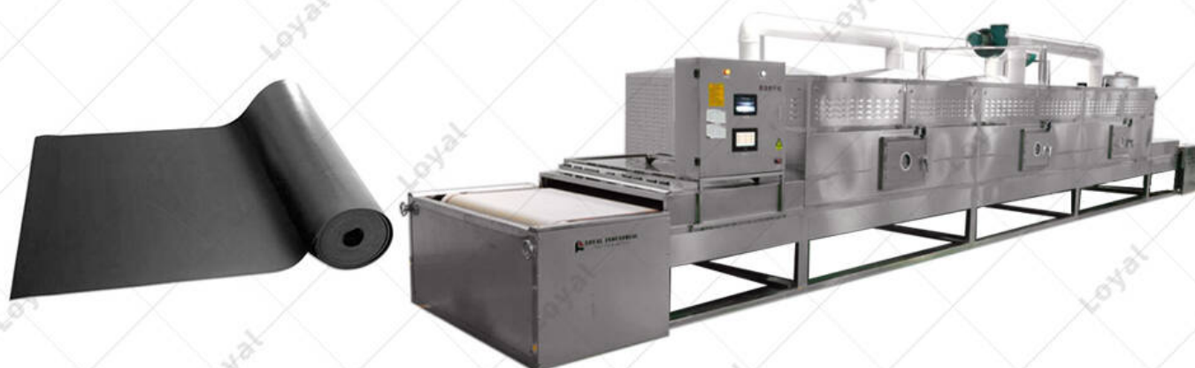
CAD of Continuous Microwave Rubber Mattress Drying Machine