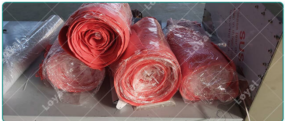
Testing of Continuous Microwave Rubber Mattress Drying Machine in factory