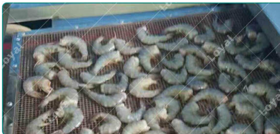
Applications Of Microwave Prawn Drying Machine: