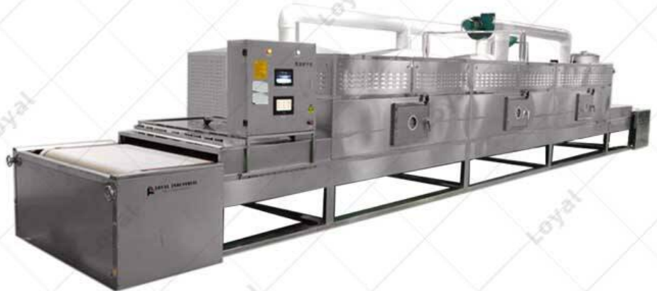
CAD Of Microwave Thawing and Sterilization Machine for Seafood