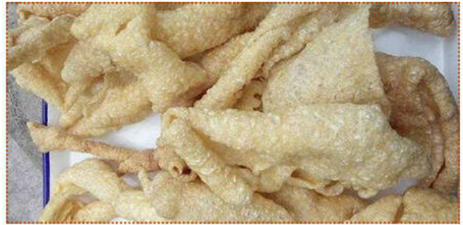
Application of Industrial Pork Rinds Frying Machine