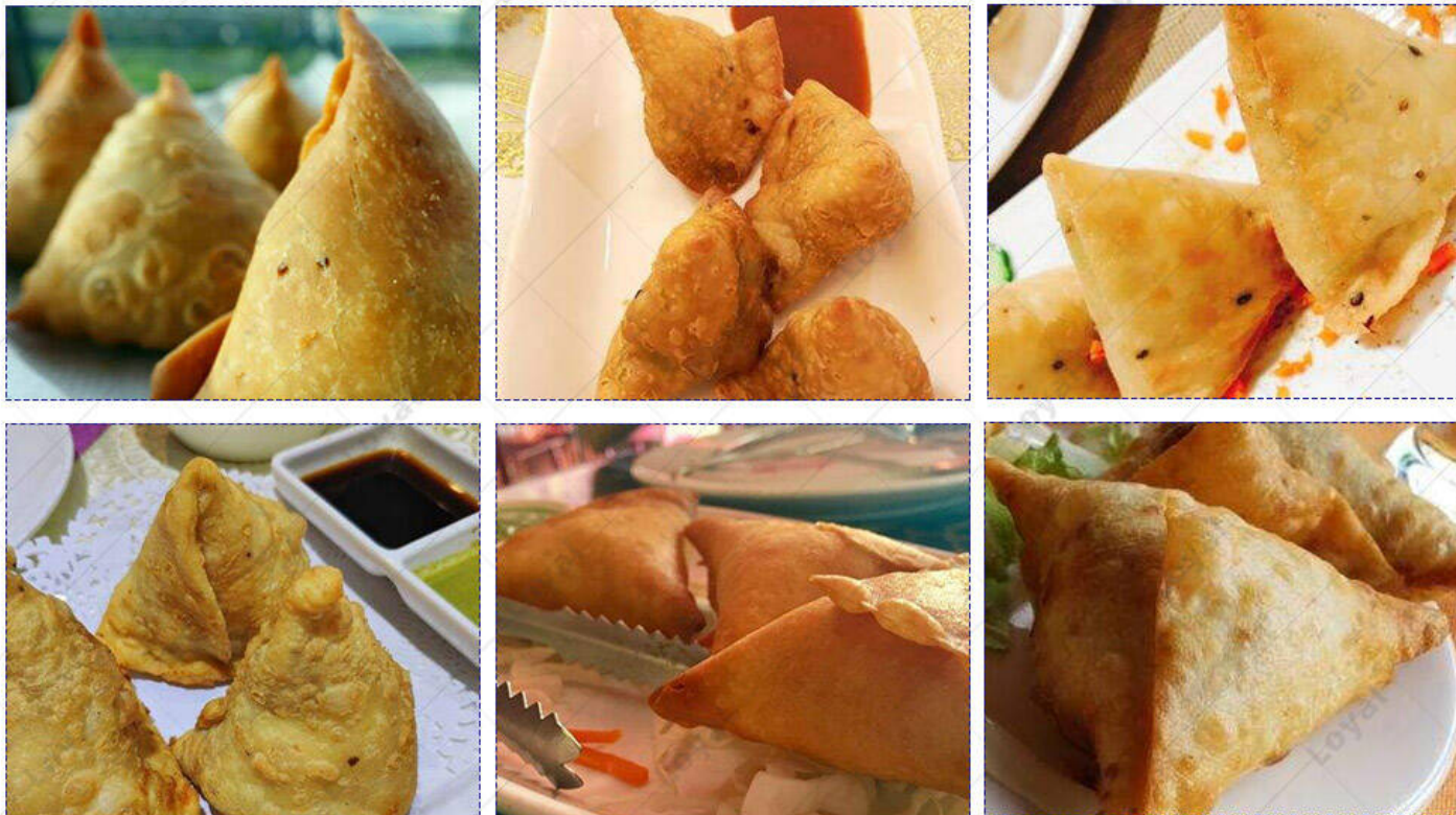
Continuous Fryer Samosa Processing Sample