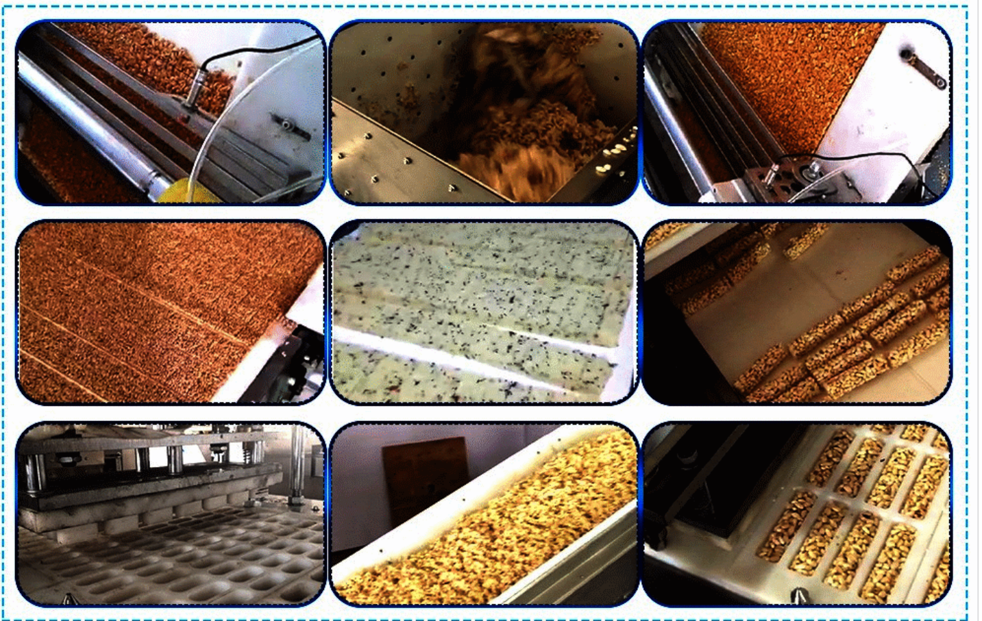
Display of finished products