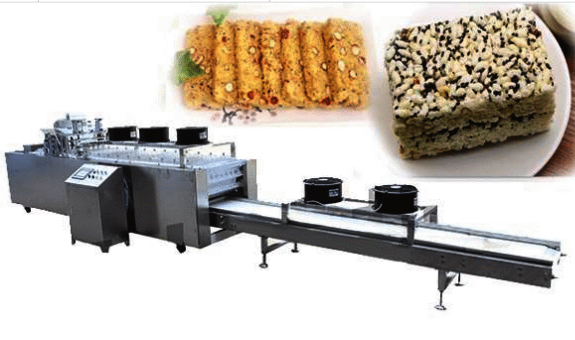
snack bar production line