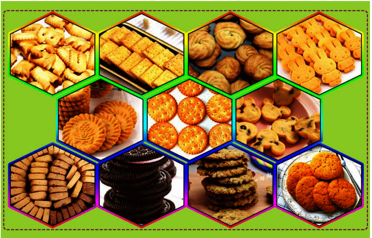
Sample of the Automatic Biscuit Machine Industrial Biscuit Making Machine