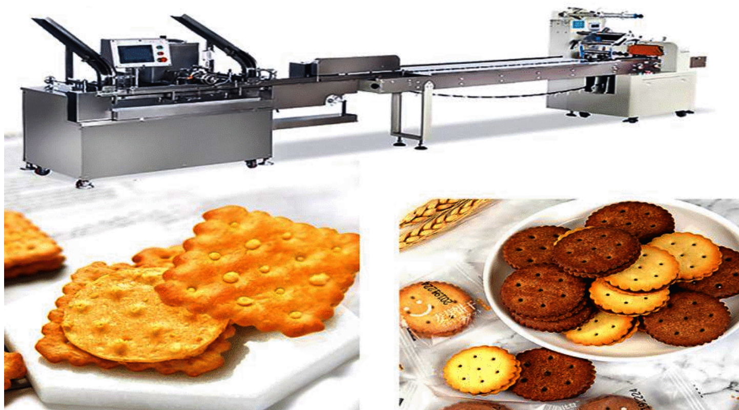
Durable Automatic Biscuit Machine Industrial Biscuit Making Machine With High Accuracy