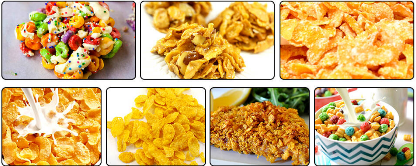
Sample of Corn Flakes of Corn Flakes Productiin Line