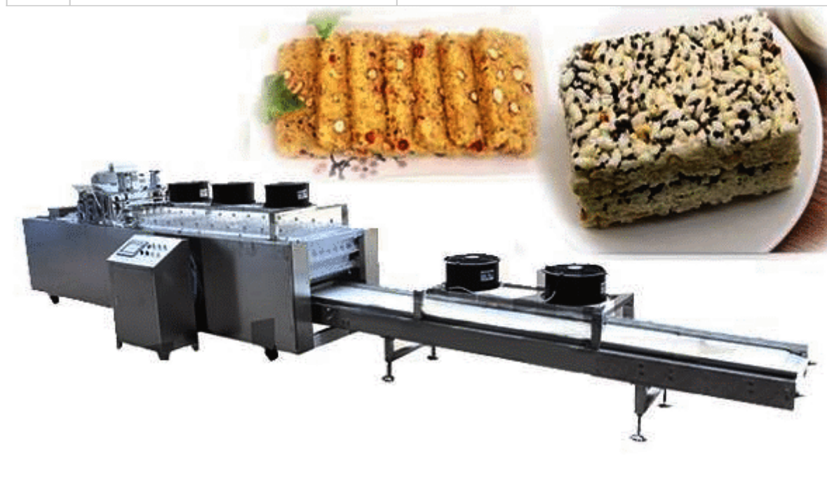
snack bar production line