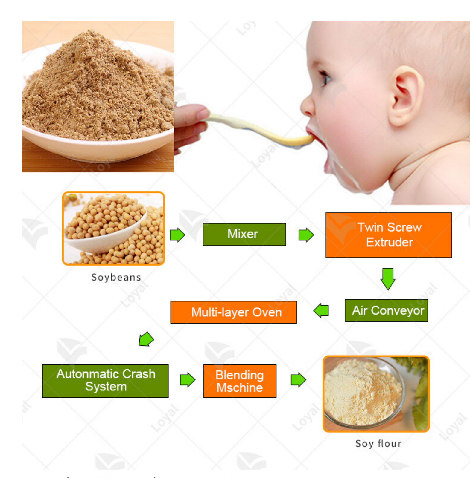
Types of Nutrition Powders You Can Create

The true magic of a nutrition powder machine lies in its ability to turn almost any ingreinto a versatile, nutrient-dense powder. From everyday staples to specialty blends, he look at the diverse range of powders you can create: