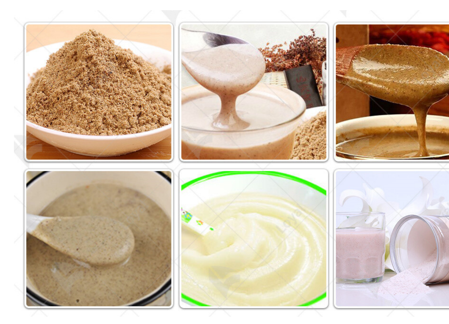
Key Features of Fully Automatic Nutrition Powder Machines

The evolution of nutrition powder machines has introduced groundbreaking features to redefine efficiency in food manufacturing. At the core of modern nutrition powder proclines are fully automated systems designed to deliver precision, scalability, and minimuman intervention.