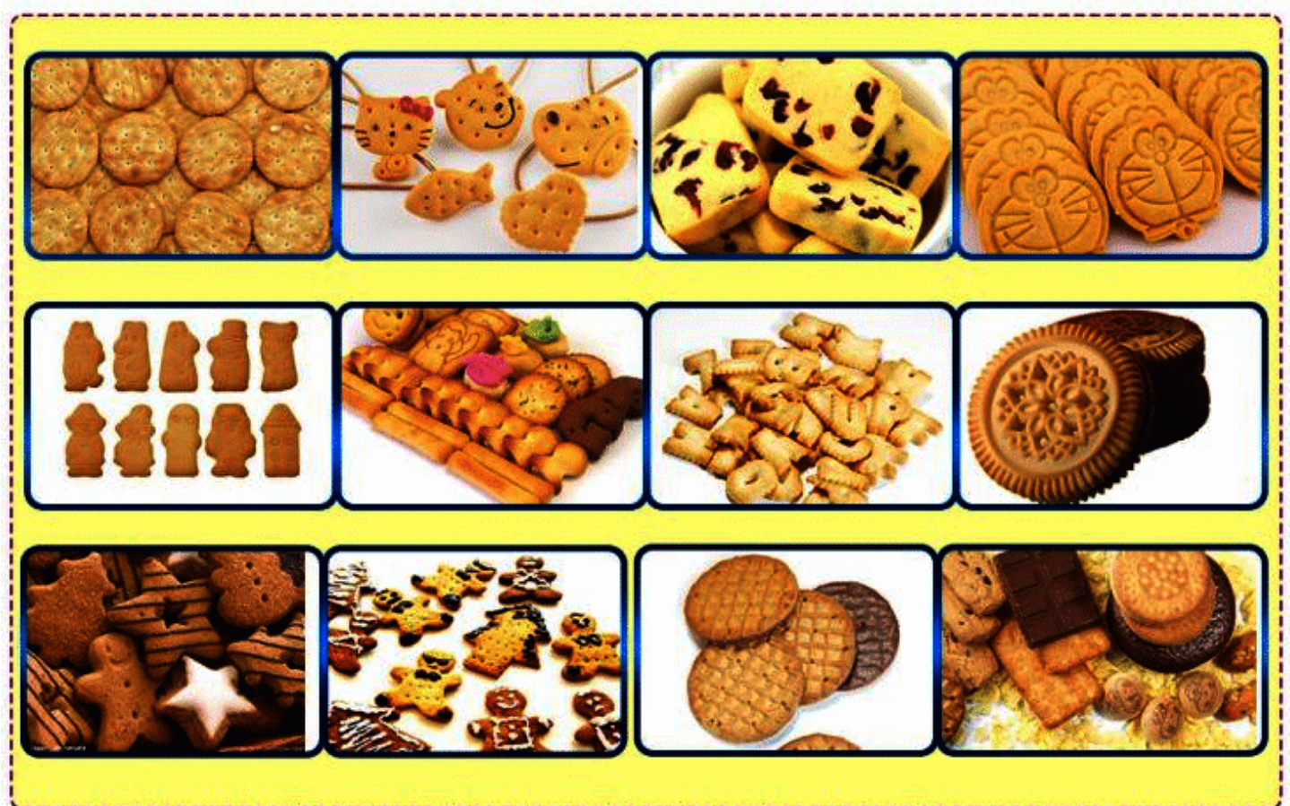
Finished Products Pictures For Biscuit Production Line