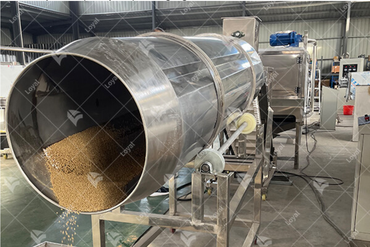
The Detail Descriptions of Thefish feed production line

7.Cooling Machine: The function of the cooling machine is to cool the baked biscuits. Through forced ventilation or other cooling methods, it quickly reduces the temperature of the biscuits, dissipates the heat, and stabilizes the internal structure of the biscuits. This prevents the biscuits from becoming soft, deforming, or deteriorating due to excessive temperature during the subsequent packaging process, and it also helps improve the efficiency and quality of packaging.